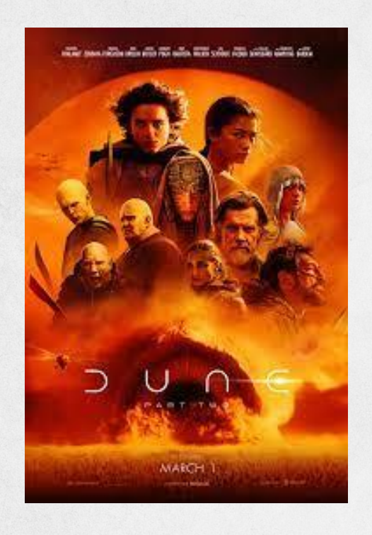
By: Levi Simpson

depends on the person and their spiritual sensitivity. I would suggest this movie, but first prepare yourself for an uncomfortable situation if you are spiritually sensitive.