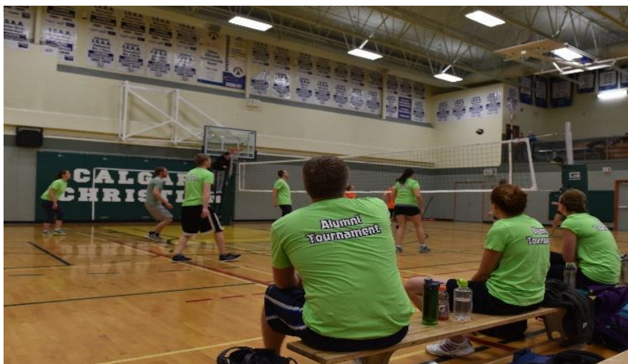
Players and fans enjoyed the games and had fun re-connecting on and off the court!