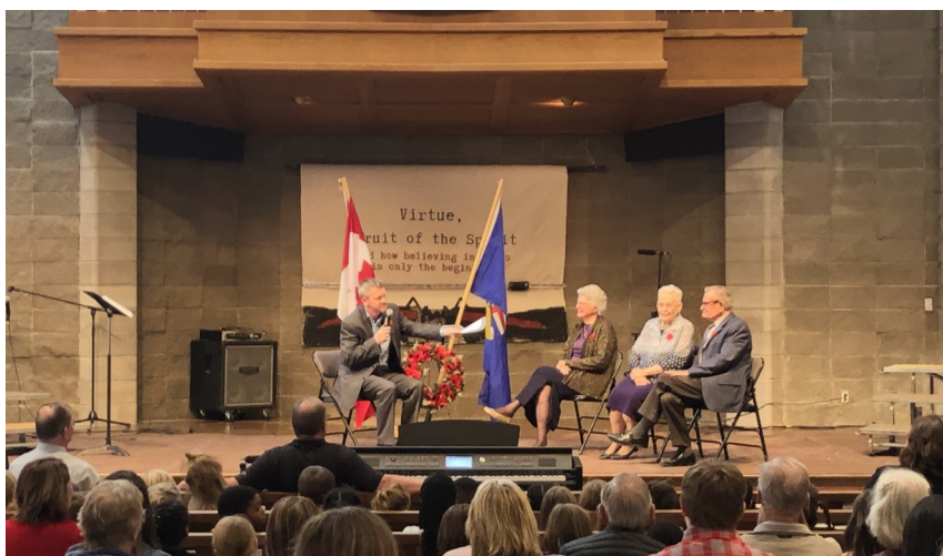
Remembrance Day Chapel with Special Guests