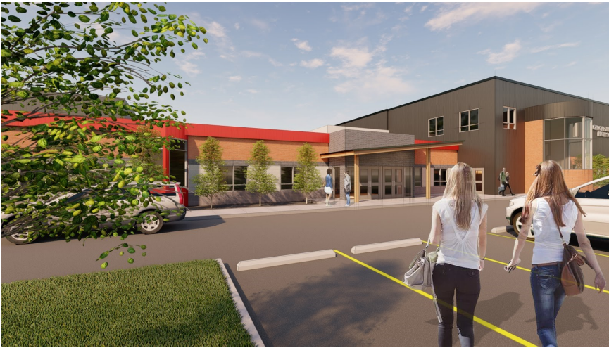
Mock up of the front of the entrance of the Secondary school from architects