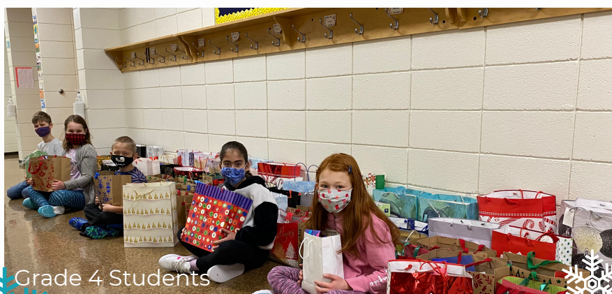
Grade 4 Students