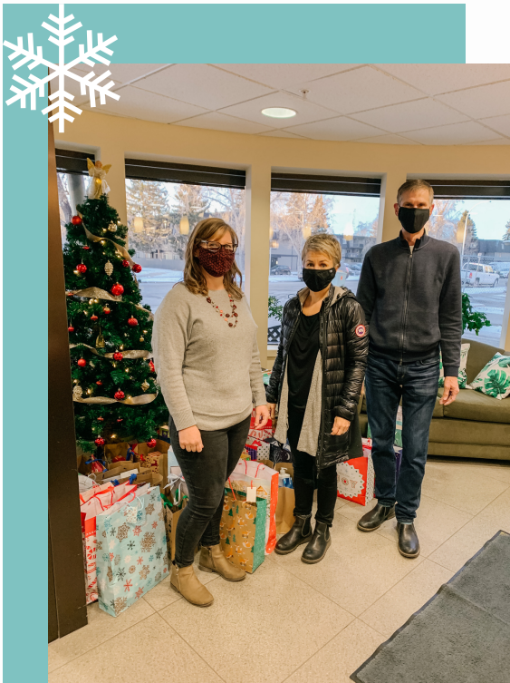
CCS Staff Delivering the Donations

“Thank you to all the volunteers that contributed. We are feeling so loved and spoiled.”