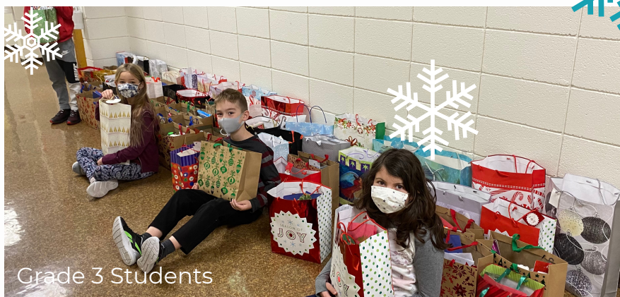
Grade 3 Students

73 care packages were made and delivered to Shalem Manor. What a way to be community builders with our neighbors!