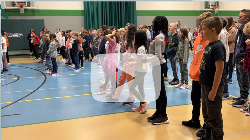
DIVISION II CHAPEL, STUDENTS SING OUT WORSHIP LYRICS: "IN MY FATHER'S HOUSE, THERE'S A PLACE FOR ME. I'M A CHILD OF GOD, YES I AM."

Calgary Christian School students, teachers and staff are "On the Path" together. Our infallible identity as God's Children is constructed and reinforced as we go. Applying faith in real life better shapes this identity in the world. CCS employs the Teaching For Transformation model as a means of weaving the faith throughout a student's life and making it relevant and applicable; truly a part of who they are and who they endeavour to become. Servant-Workers, Justice-Seekers and Community-Builders are just three of the ten TFT thoughtlines that students apply on their journeys. Travelling on the path of God's Kingdom together, in community, helps us all to find our identity rooted in him and incorporate our faith consistently along the way.